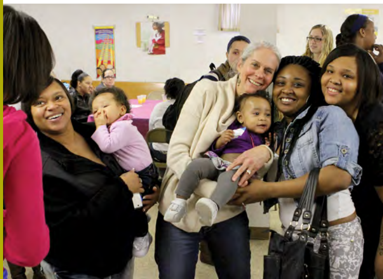
The Moms2B program creates a serious, yet joyful learning community for pregnant women in neighborhoods like Weinland Park.